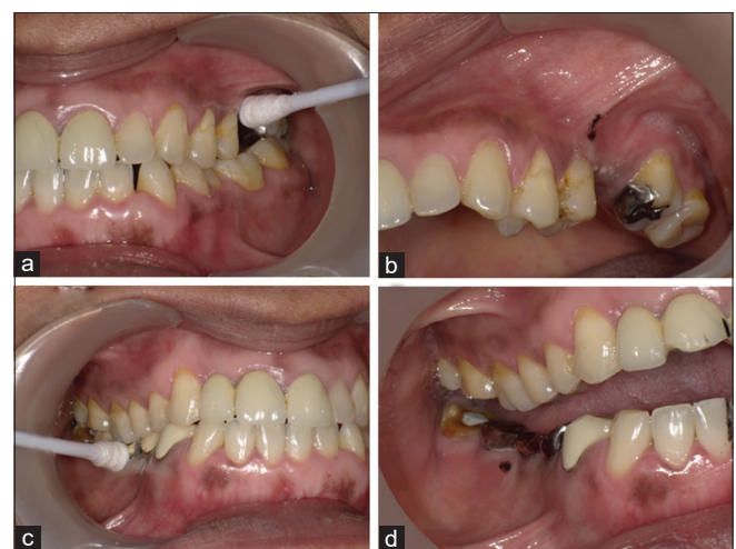
Figure 1: Localization and marking of the TrN lesions. (a and c) Pressure with cotton bud identifying a 3X3mm area on the mucobuccal fold and gingiva. (b and d) Site of the lesions marked with dye

The differential diagnoses of this type of localized reproducible neuropathic pain include trigeminal neuralgia (TN), painful post traumatic trigeminal neuropathy (PTTN), and trigeminal TrN. The clinical features of reproducibility of pain from percussion/local pressure, rather than by light touch (characteristic of TN); and the fact that there was a lack of refractory period, points the diagnosis in the direction of trigeminal TrN. Conceivably, TrN although not officially classified, has similar features described in the literature with those of PTTN.